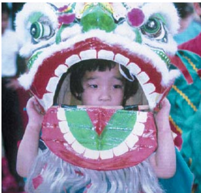
"Chinese New Year"

Public art has moved beyond the traditional sculpture, such as "the man on a horse". Today, there are many new styles and materials used in creating public art. They include mixed media, sound, light, and landscaping. The integration of public art, architecture, landscape and urban design will create special places that humanize the urban environment.