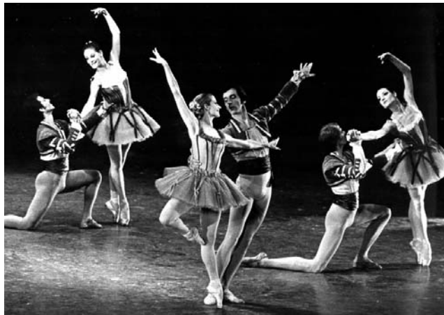
Variations de Ballet

Increase public awareness of the arts by developing a promotional guidebook to the arts downtown.