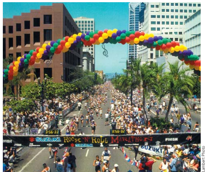
Rock'n Roll Marathon

This study has striking national implications. Because of the variety of communities surveyed and the rigor with which the study was conducted, estimates of the national economic impact of non-profit arts organizations can be extrapolated. For example, the non-profit arts industry supported an average of 1.3 million jobs in the United States during each of the three years studied.