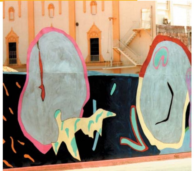
Art on the Horton Plaza construction fence

The arts have a positive impact not only on a community's quality of life, but also on the entire social and business fabric. The arts attract business investment, reverse urban decay, revitalize struggling neighborhoods, and draw tourists. Attendance at arts events generates related commerce for hotels, restaurants, parking garages, galleries, and more. Arts organizations themselves are responsible businesses, employers, and consumers.