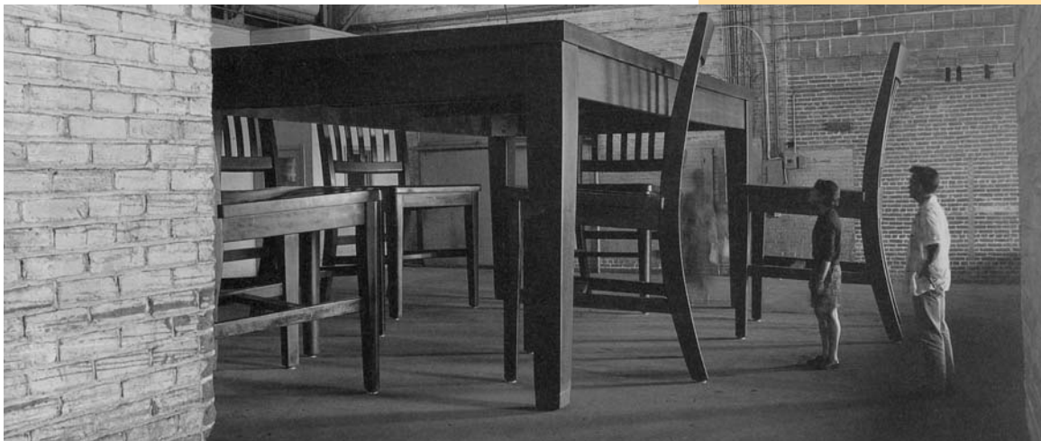
"Under the Table"

The arts have a positive impact not only on a community's quality of life, but also on the entire social and business fabric.