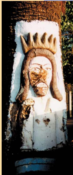
"El Rey Cristo" 17th St.